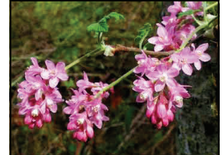
Red Flowering Current