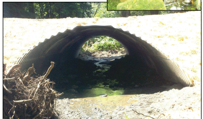
Before (top photo): Undersized culvert on a tributary to Coville Creek